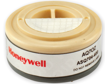
Sensor Part Number: ASQ704-400

The AQ7 Series are for environmental applications; other applications, including industrial safety, may not be suitable.